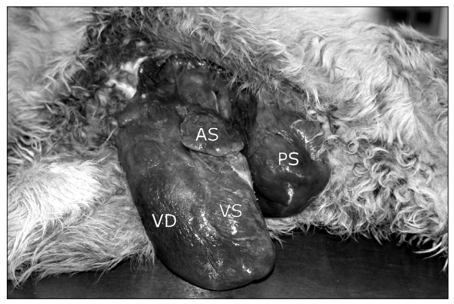
Plate IV Frackowiak H. et al.: Congenital sternal ... pp. 51-54

Fig. 1. Limousin calf with ectopia cordis (lateral view).