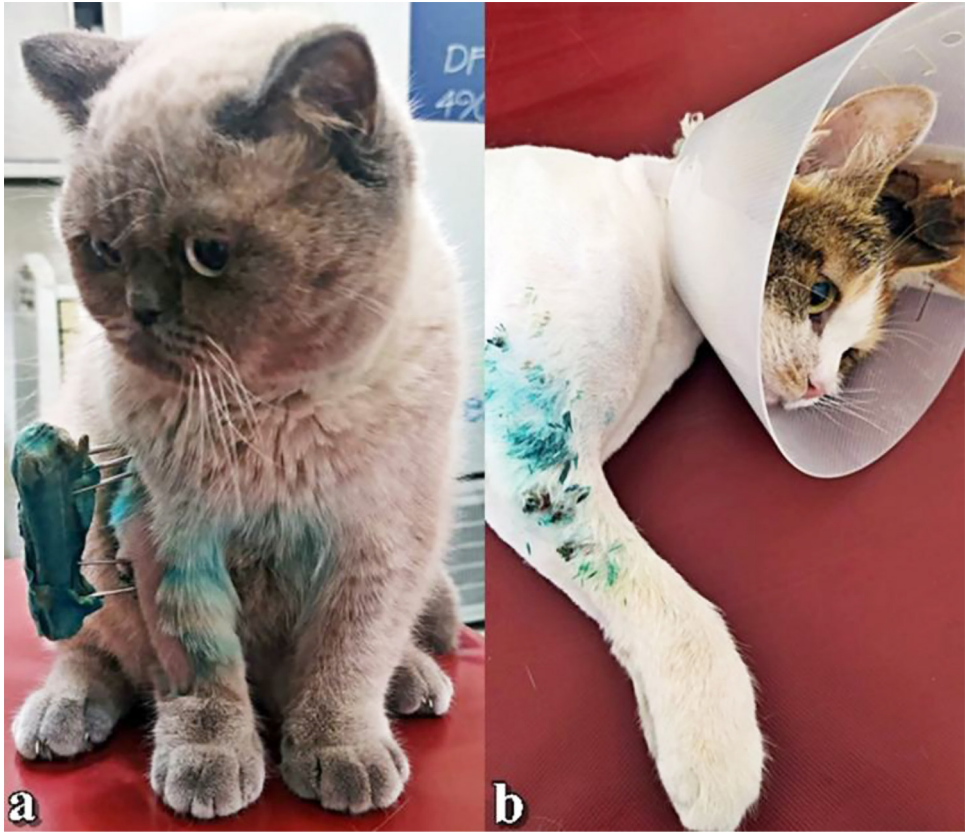
Fig. 3. Clinical images: (a) Case 2 at postoperative week 4 before external fixator (EF) removal; (b) Case 6 at postoperative week 6 after EF removal under sedation.